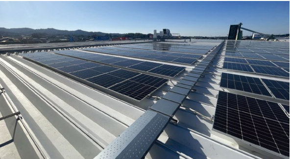
MEGA Don Quijote UNY Kakegawa Store

Overseas as well, we have introduced solar power generation equipment at stores in Hawaii and Thailand, working to reduce CO 2 emissions.