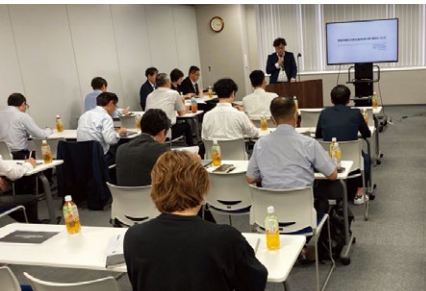
Explanatory session for business partners (held in June 2025)

In the distribution sector, we are cooperating with logistics partners to promote freight transportation that balances environmental considerations with productivity improvements through modal shifts, the utilization of electric vehicles and double-linked trucks, and the review of delivery plans through inventory optimization in the transportation and delivery of products.