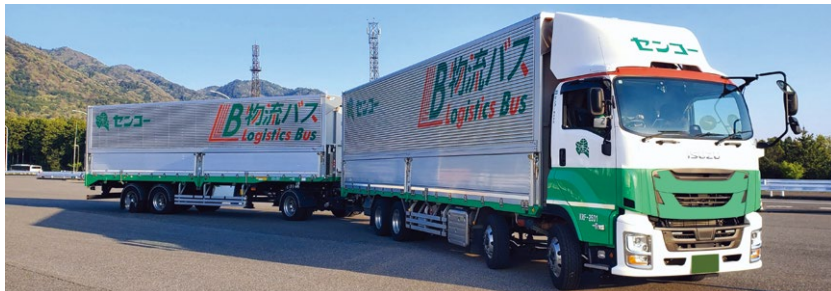
Operating double-linked trucks between Kanto and Kansai bases and between Kanto and Tokai bases