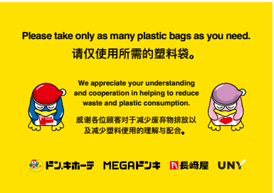
In-store poster encouraging customers to reduce use of plastic produce bags

We regard addressing environmental pollution caused by plastics, such as global warming and marine plastic waste issues, as our social responsibility as a retailer. We are working to reduce the environmental impact of our business activities through initiatives such as reducing plastic produce bags used in customer service, changing materials for plastic cutlery, and reducing the thickness of laminated POP displays used in store presentations.