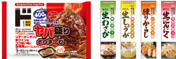
Adopting water-based flexographic printing for product packaging to reduce CO 2 emissions Using 10% biomass materials in some plastic materials of products

■ Environmental initiatives for PB/OEM products We are working on environmentally conscious product development, including reducing the thickness of product packaging materials and containers, adopting biomass materials, and utilizing environmentally friendly materials and technologies for package printing.