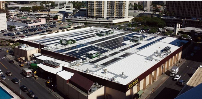
Don Quijote Kaheka Store