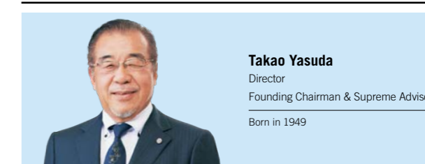
Takao Yasuda Director Founding Chairman & Supreme Advisor Born in 1949